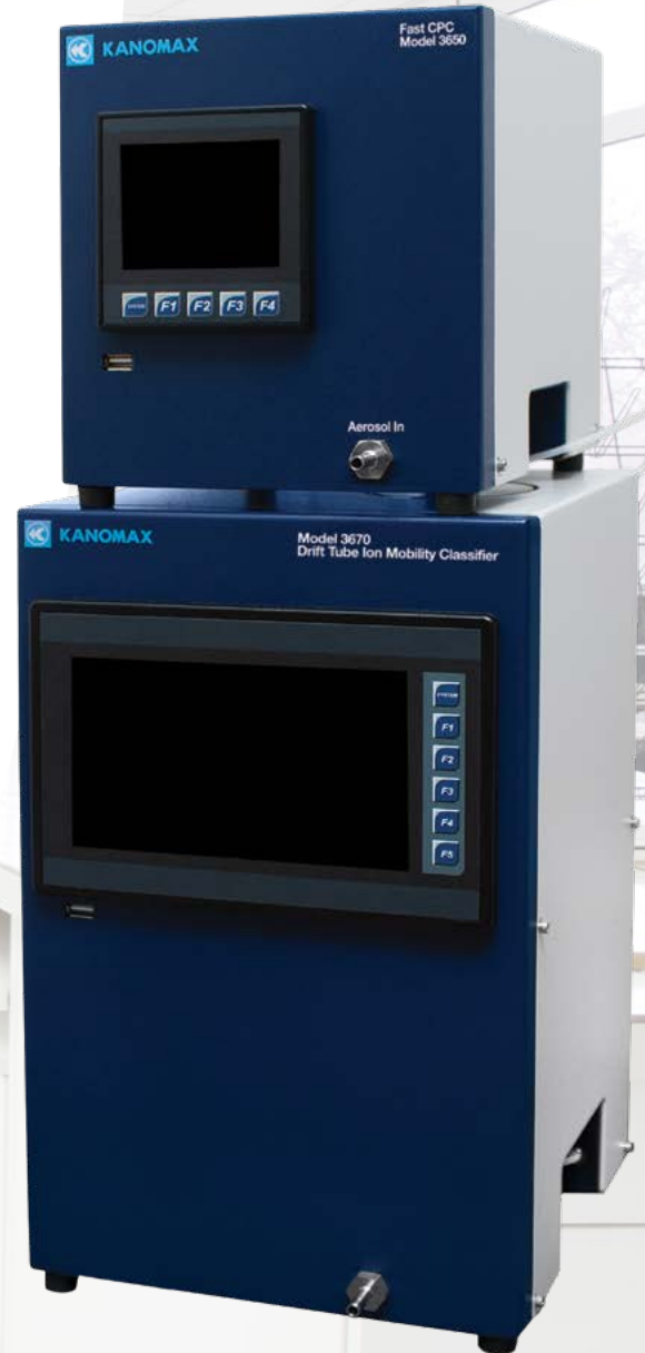
Figure 1. Photo of the DTIMS