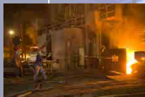
Checking worker exposure to airborne contaminants