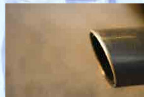
Engine Exhaust Testing