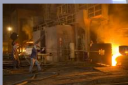
Checking worker exposure to airborne contaminants