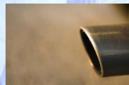
Engine exhaust testing